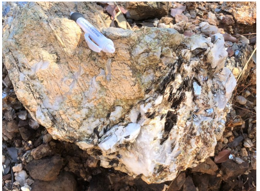
Photos 2 & 3 (above and left) showing the coarse grained muscovite pegmatites at Dividend Gully (Left) and Mountain Maid (Right) Prospects