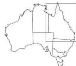
Figure 1. ActivEX Limited Queensland Projects and tenements